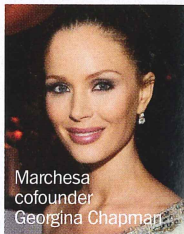
Marchesa cofounder Georgina Chapman

Marchesa devotees now know exactly how to top off their fall frocks, thanks to Le Métier de Beauté's Marchesa collection. Georgina Palette, $65 (brilliant for touch-ups—it's the size of a credit card); Lipgloss in Le Feu/La Glace, $38.